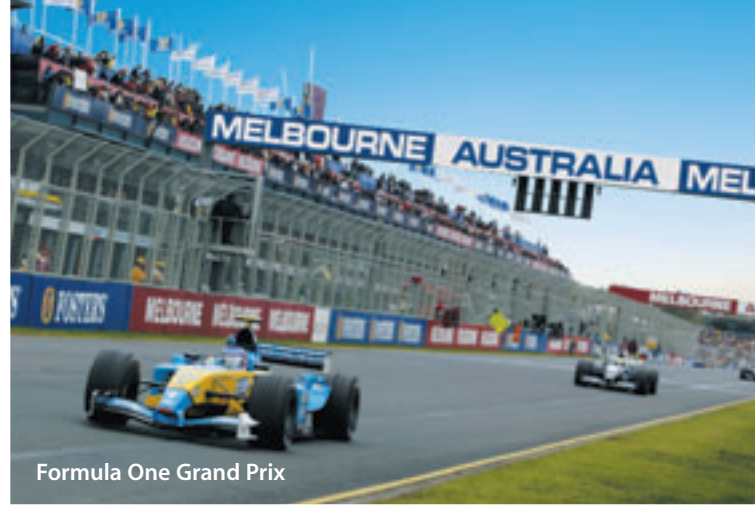
Formula One Grand Prix