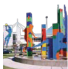
MSAC opens its doors to the public