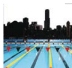
MSAC Stage 2 Feasibility study completed