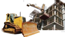
MSAC Stage 2 construction commenced